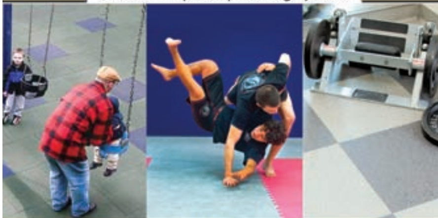
Playground Rubber Tiles