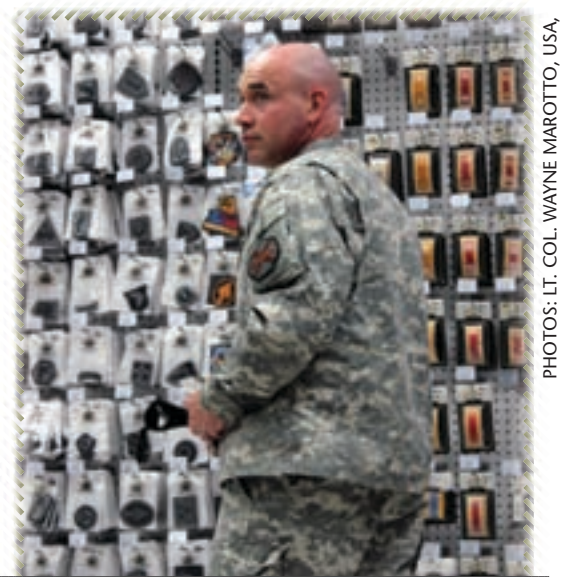
A soldier looks for an Army unit patch at AAFES's Wiesbaden MCSS. The store is open in spite of ongoing construction at USAG Wiesbaden

Also, earplugs; several different Inova Microlights; and fleece balaclavas, a type of headgear which is used to cover the whole head and face, often only exposing the user's eyes.