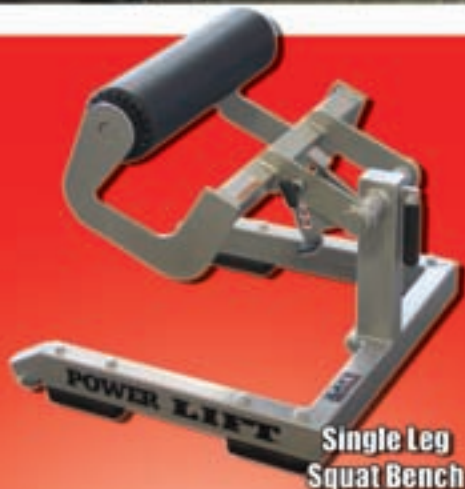
Single Leg Squat Bench