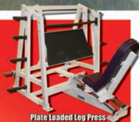
Plate Loaded Leg Press