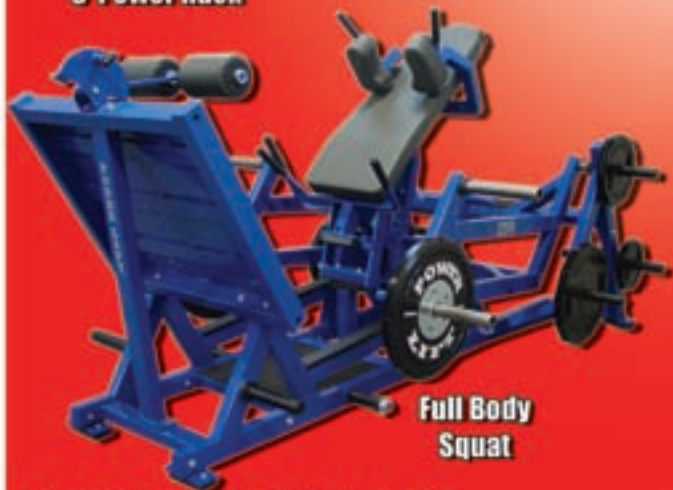
Full Body Squat