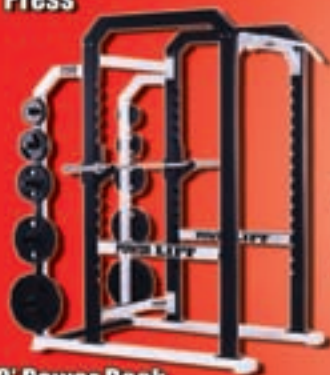
8' Power Rack

EVERYTHING YOU need for a CHAMPIONSHIP weight room