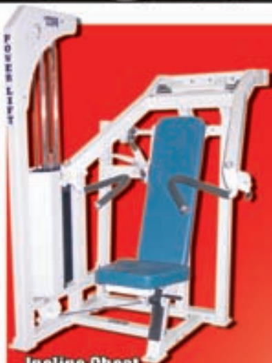
Incline Chest Press