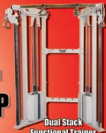
Dual Stack Functional Trainer

EVERYTHING YOU need for a CHAMPIONSHIP weight room