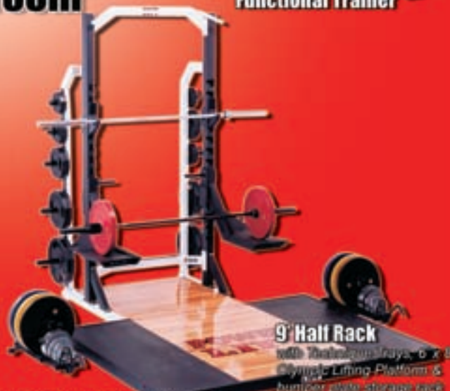
9' Half Rack with 2x2x4x8 Olympic Lifting Platform & bumper plate storage rack